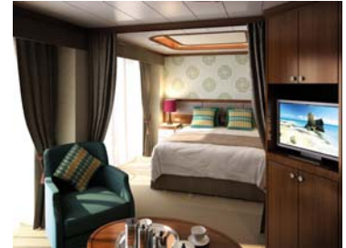
Superior deluxe with balcony